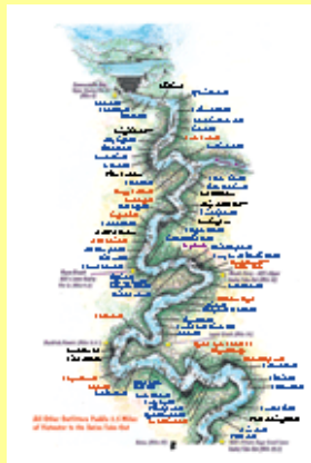
Download a pdf of the Gauley River with Rapid and Ratings Listed