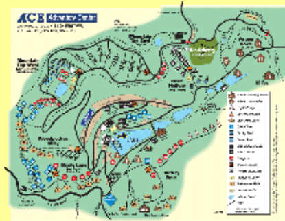
Download a pdf of ACE's 1,400-Acre Resort Map