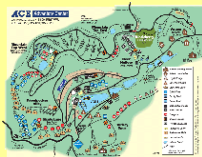
Download a pdf of ACE's 1,400-Acre Resort Map