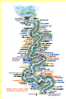
Download a pdf of the Gauley River with Rapid and Ratings Listed